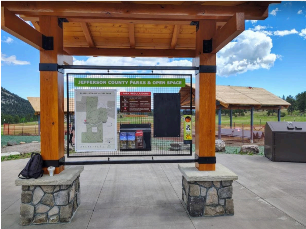
New Kiosk at Alderfer/Three Sisters Open Space Park, West Trailhead. Gooseberry and Kinnikinnik shelters in the back. Shelters are reservable through the Evergreen Parks & Rec District.

Working to conserve Jefferson County Open Spaces since 1972