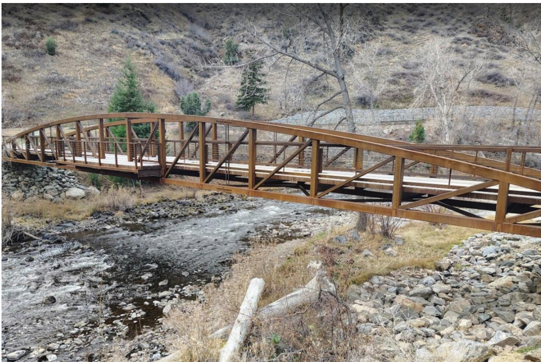
Bridge at the CCR Trailhead, Clear Creek Canyon Open Space Park.