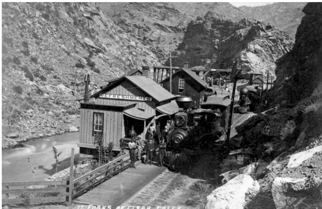
Colorado & Southern Railroad at the forks of Clear Creek. Approximate location of the new CCR Trailhead, Clear Creek Canyon Open Space Park.

https://www.denvergazette.com/outtherecolorado/2026/06/26/epicenter-of-colorados-most-intense-drought-is-located-in-heart-of-outdoor-recreation-country/