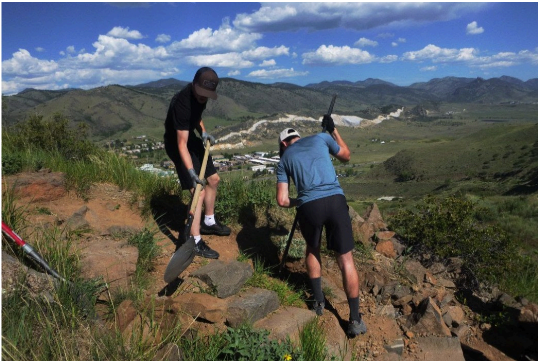
National Trails Day 2026, North Table Open Space Park. Volunteers working on the rock steps to the Quarry.

Check the calendar for upcoming agendas https://www.jeffco.us/1581/Advisory-Committee Find all available past meeting documents & videos at https://www.jeffco.us/4528/Past-Meeting-Videos-and-Documents