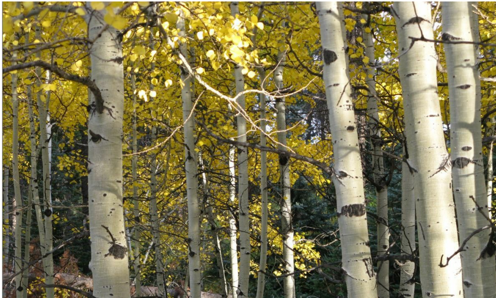
Aspen grove in Autumn

Working to conserve Jefferson County Open Spaces since 1972