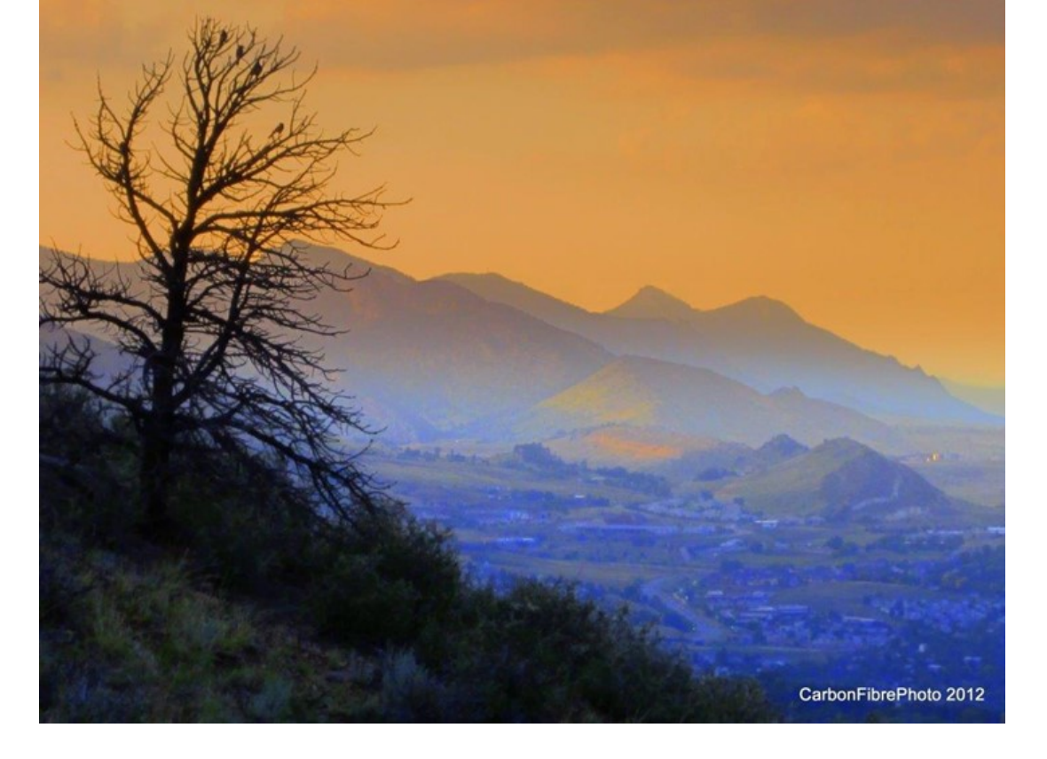
Aspen Park at Evening, photo courtesy of CarbonFibrePhoto 2012