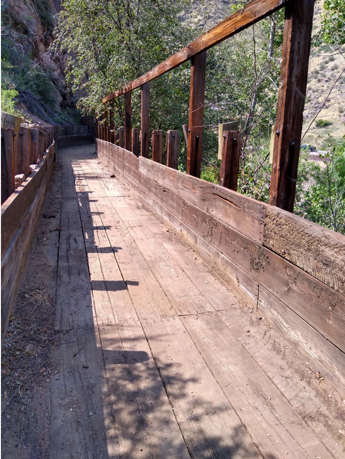
Welch Ditch Trail, wooden flume