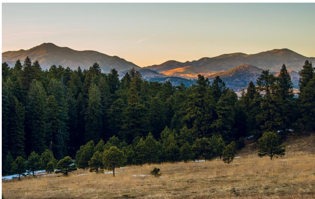
circa 2020

https://planjeffco.org/portfolio-item/pj-board-meeting-minutes-11-16-2023/